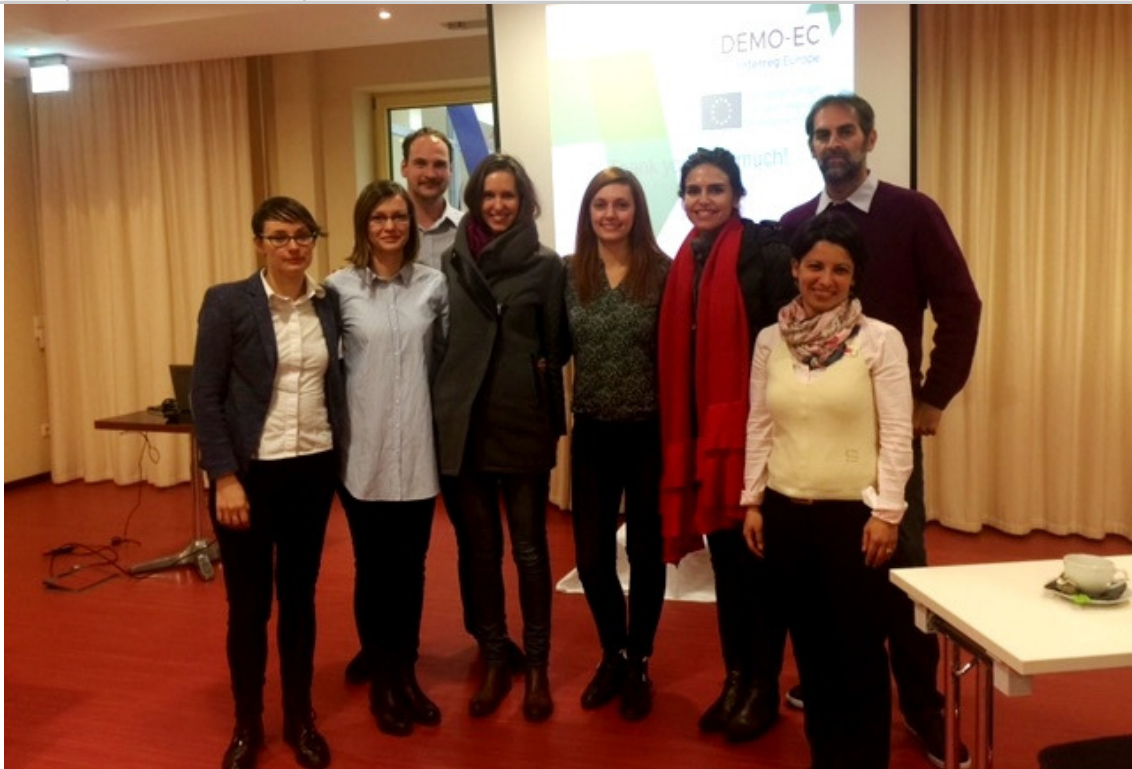
Picture of project partners from Kick-off Meeting, which was held between 2. and 3. March 2017 in Leipzig, Germany.

On 2. and 3. March 2017 the kick-off event for DEMO-EC took place in the Westbad location on the western site of Leipzig. The project objective is to integrate mobility management in city development. The aim was to get to know each other and jointly decide of the main tasks in the first and second semester, the process of project and the exchange of experience. Part of the first day was, beside administrative project management issues, the exchange of experience regarding the topics e-mobility, participation procedures, mobility behaviour, public transport, reduction of cars, cycling and walking. On second day, the partners get detailed information of the traffic concept for inner-city of the City of Leipzig including a study visit through the inner city.